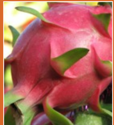
Ben Thanh Market